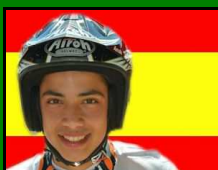
17 RIBA MARC